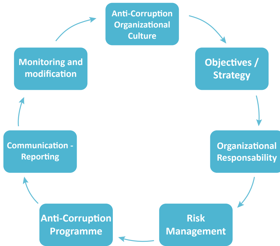
Fig. 1: Components of Corruption Prevention Systems, SAI of Austria