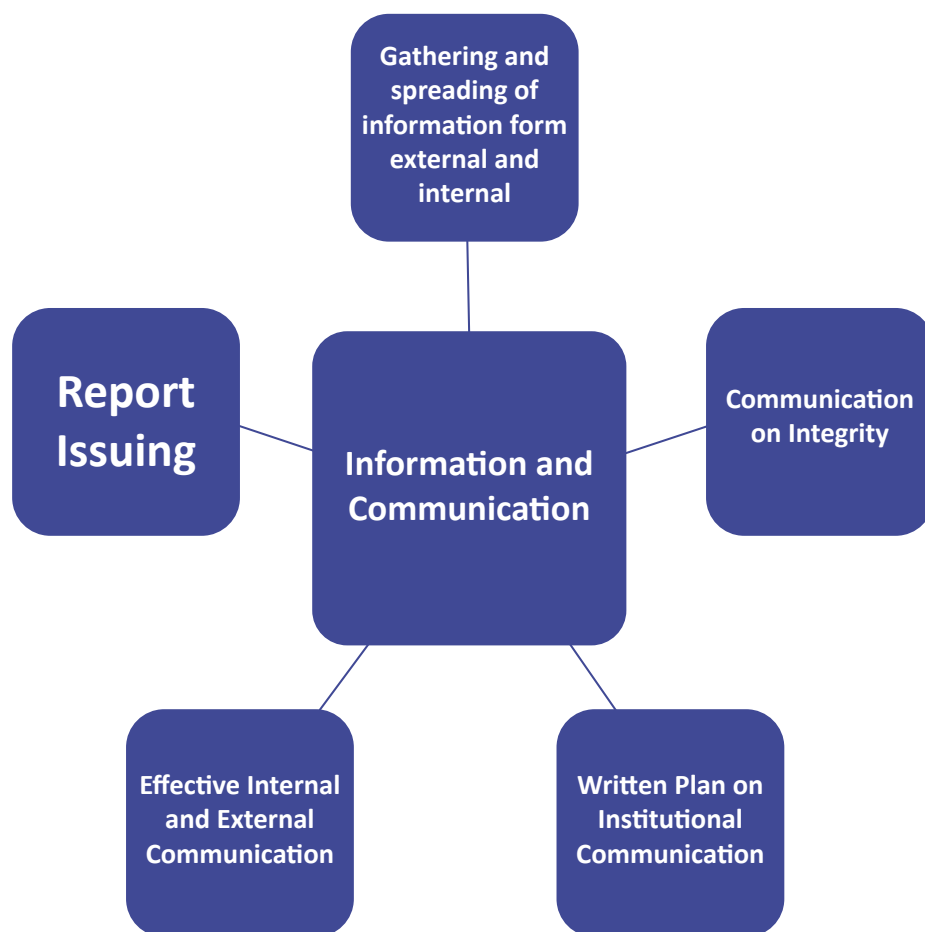
Fig. 3: Internal and External Communication Flows, SAI of Mexico